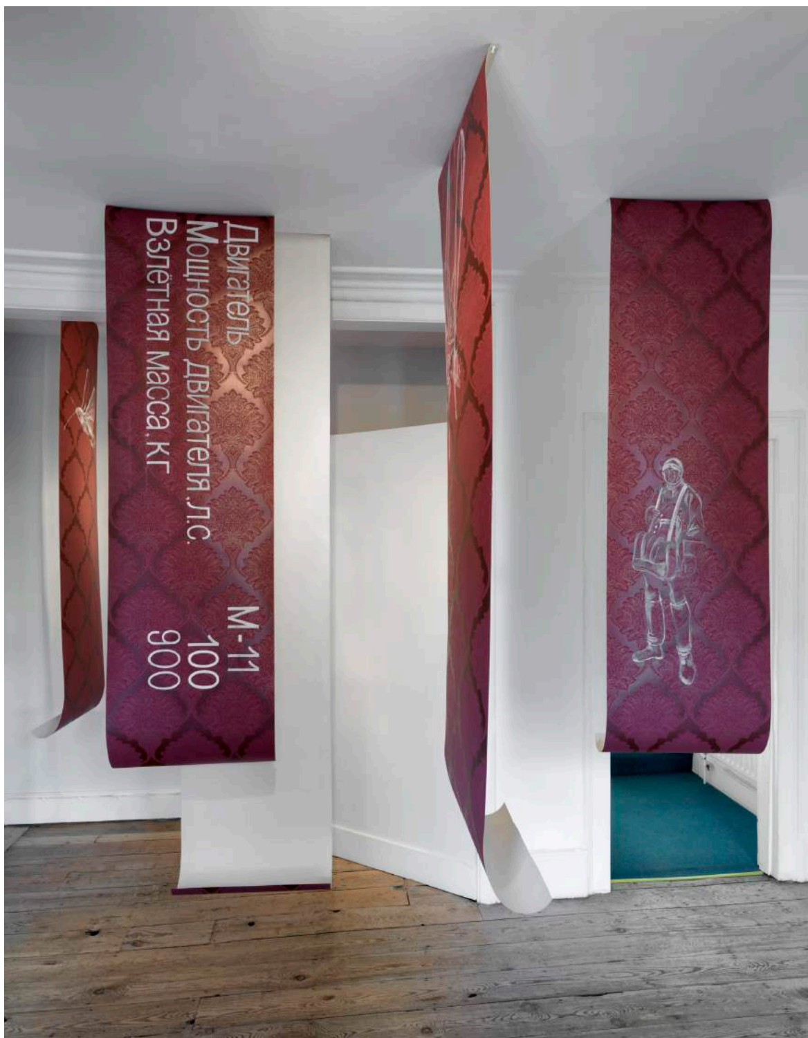
Varvara Shavrova, Inna's Dream (detail), acrylic on wallpaper, metal pins, dimensions variable, 2019