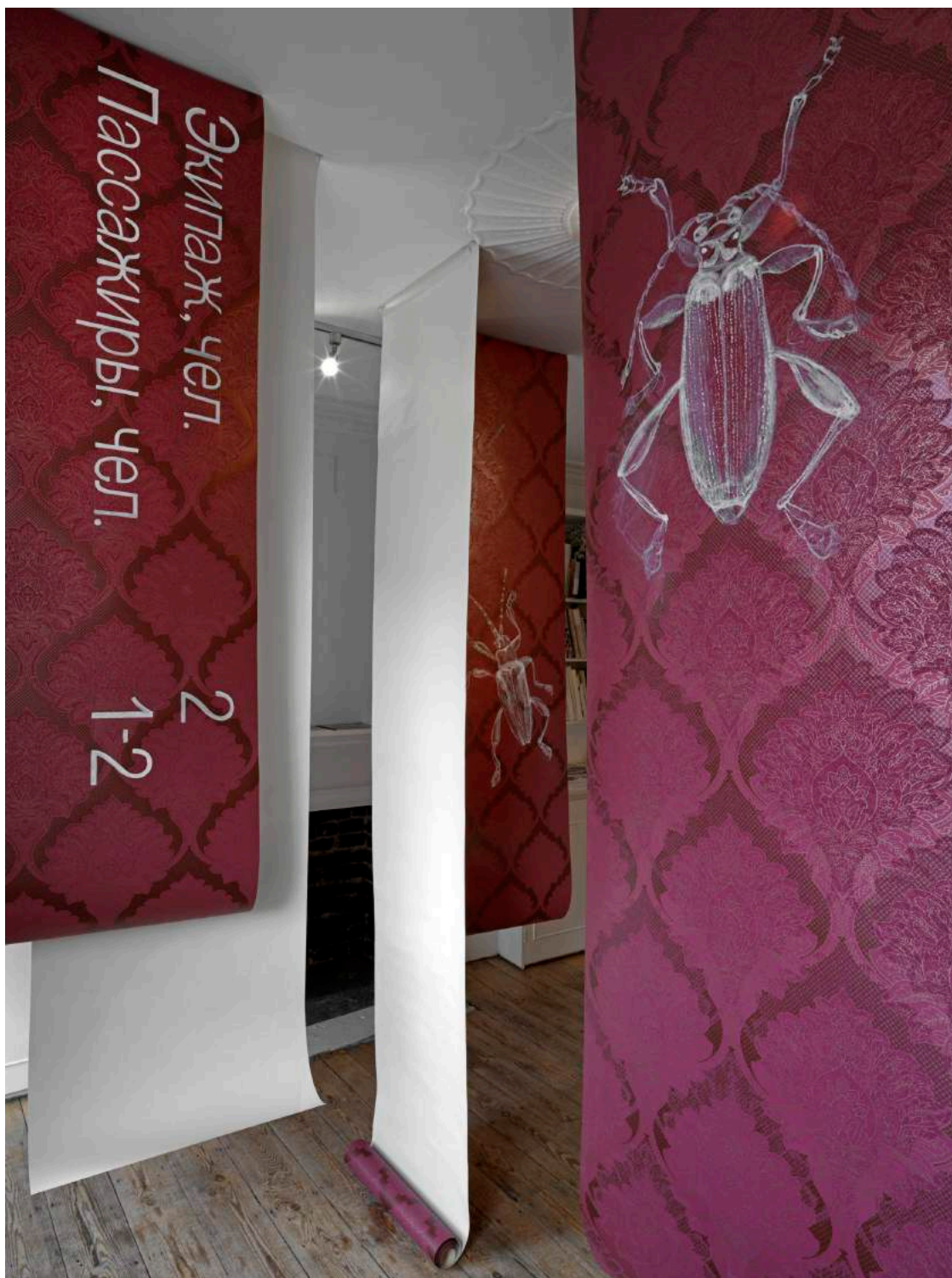
Varvara Shavrova, Inna's Dream (detail), acrylic on wallpaper, metal pins, dimensions variable, 2019