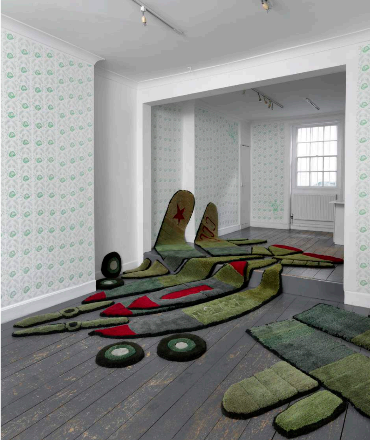
Varvara Shavrova, Inna's Dream , hand tufted Uxminster wool carpet objects, hessian canvas backing, thread, approx. 450 x 750 cm, 2019