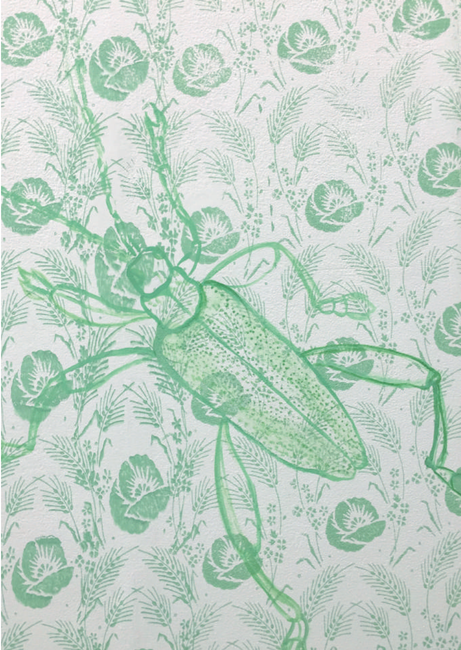
Varvara Shavrova, Inna's Dream (detail), emulsion and acrylic paint on wall surface, dimensions variable, 2019