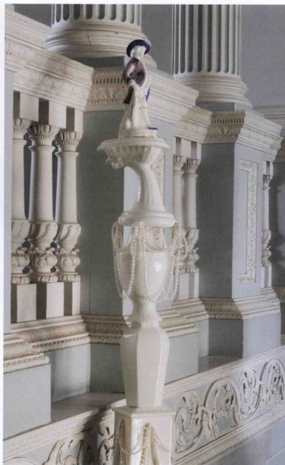
CONEHEAD: PHOTO MATT SMITH | UPPARK: PHOTO JIM TETHENSON, COURTESY THE ARTIST | THE VYNE: PHOTO SUSIE AILBERG | FITZWILLIAM PHOTO SOPHIE MURFELIAN